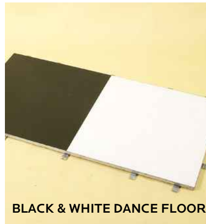
BLACK & WHITE DANCE FLOOR